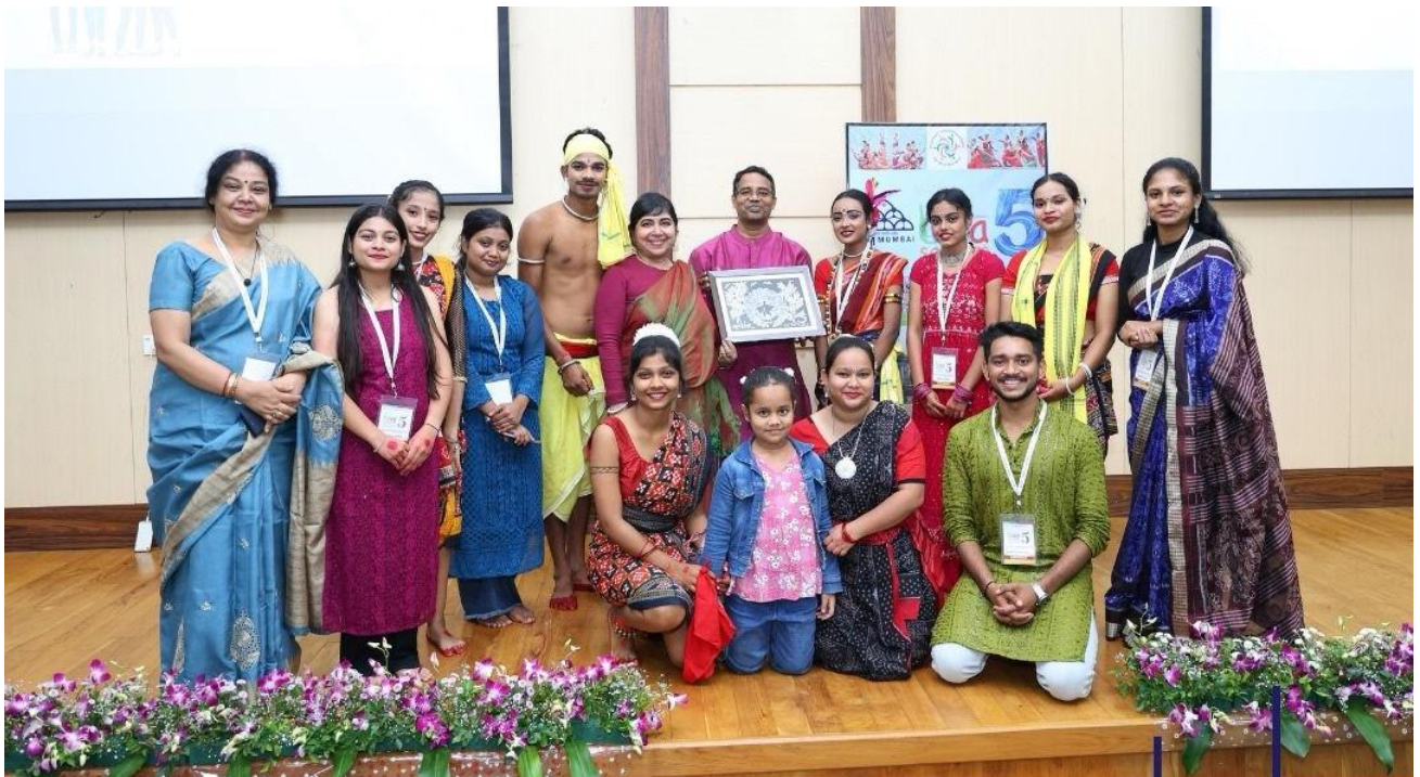
Day 3: Art, Culture and Musical performances