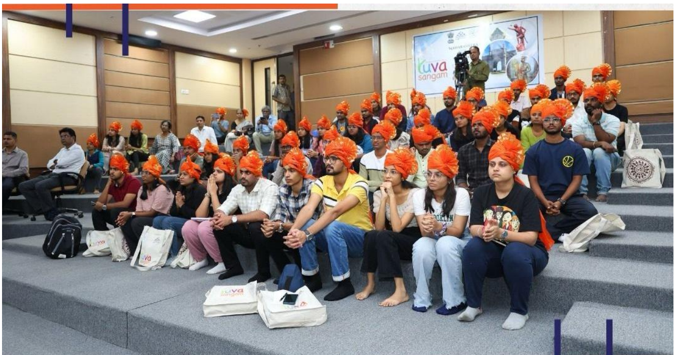
Group Photos of Maharashtra delegates for Odisha Trip at IIM Mumbai on 26.11.2024