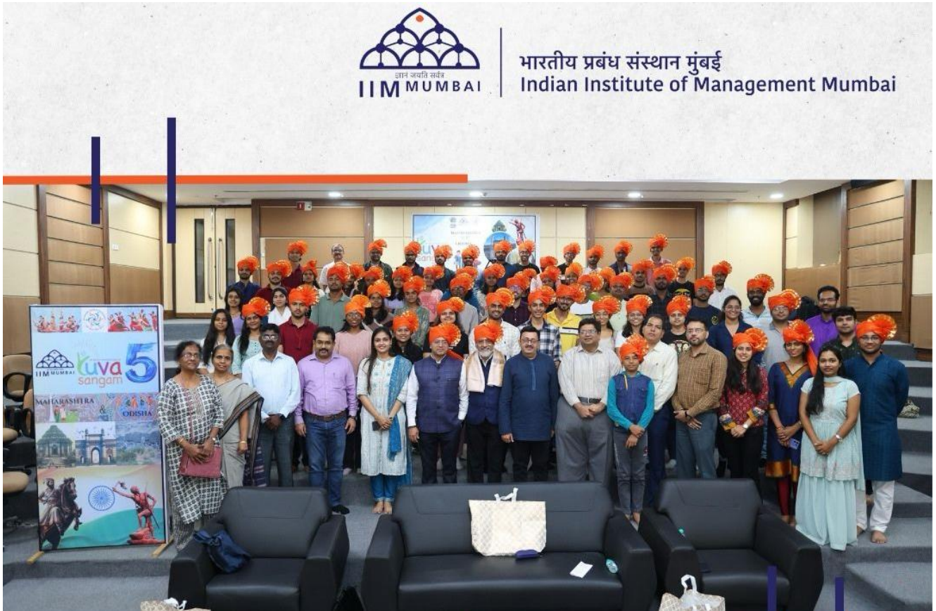
Group Photos of Maharashtra delegates for Odisha Trip at IIM Mumbai on 26.11.2024