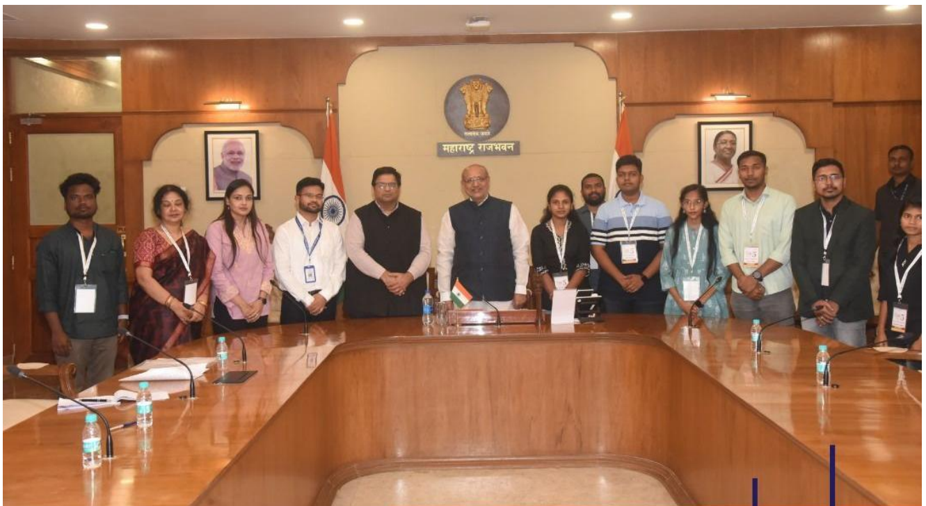
Day 2: Visit to the Governor's House