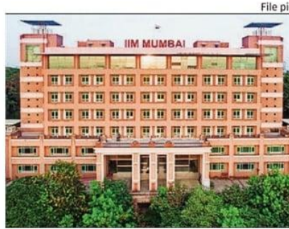
Admissions for the online MBA have begun, while plans for the other two are underway