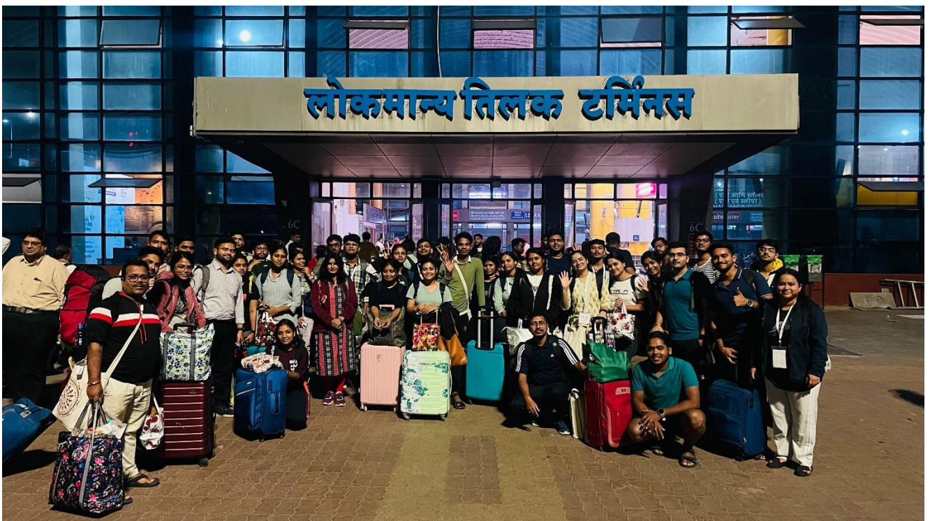
Day 5: Odisha delegates ready to return from Mumbai to Bhubaneswar