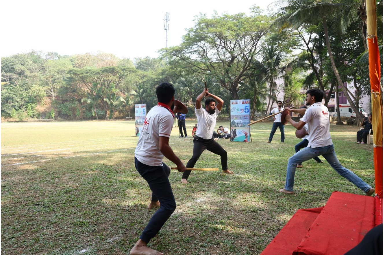
Day 3: Training the delegates with Ancient Maharashtrian Martial Art (Mardani Khel)