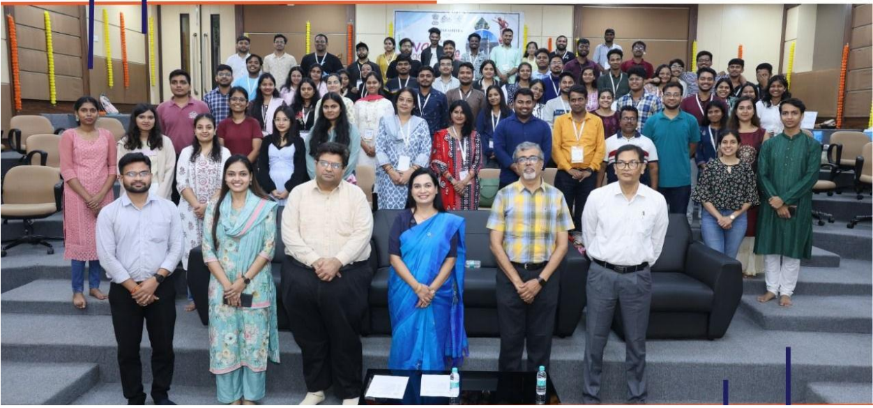
Day 5: Closing ceremony of Yuva Sangam Phase 5 at LH 04, IIM Mumbai