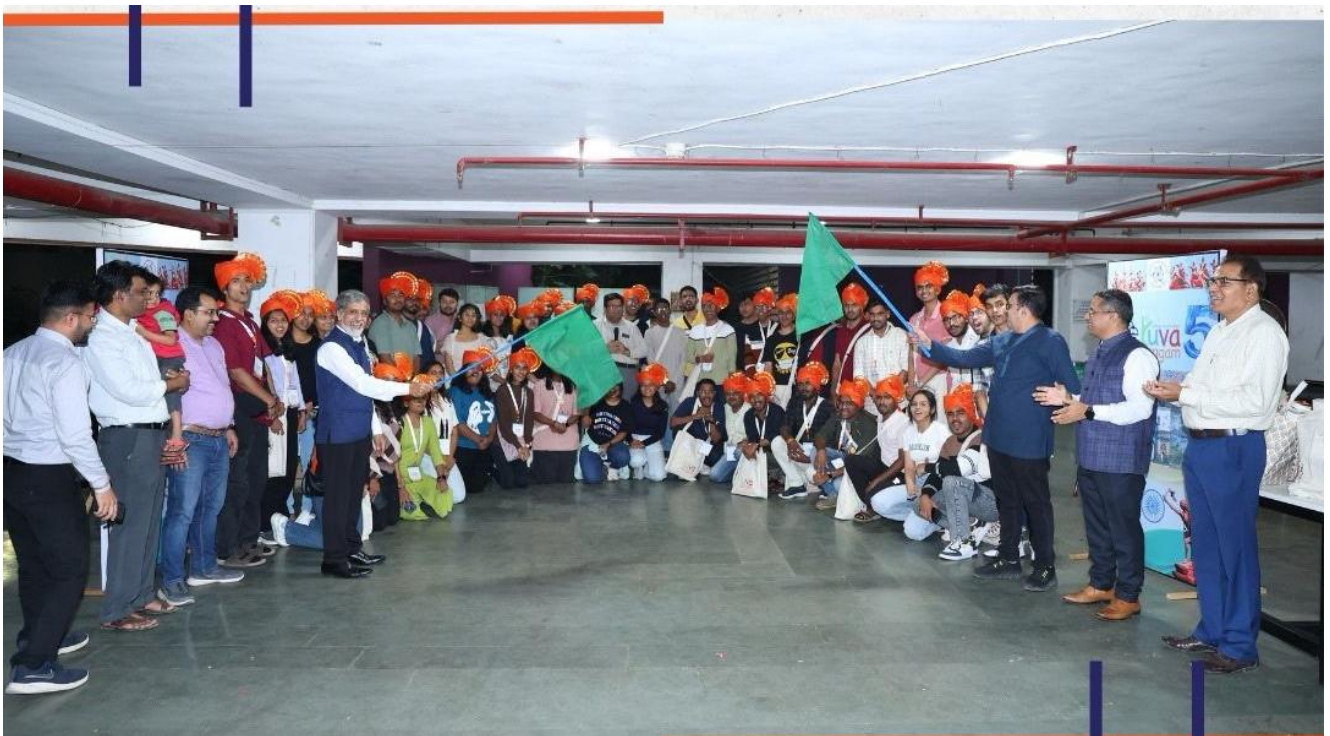
Flag-off ceremony at the Swami Vivekananda Hostel, IIM Mumbai on 26.11.2024

The much-anticipated Yuva Sangam Phase 5, an inspiring educational and cultural exchange program under the Ek Bharat Shreshtha Bharat initiative, marked its beginning with a flag-off ceremony at the Swami Vivekananda Hostel, IIM Mumbai, on November 26, 2024, at 9:30 p.m. Spearheaded by the Ministry of Education, Government of India, New Delhi in collaboration with AICTE, this initiative exemplifies the spirit of unity through diversity. The delegation embarked on their journey from LTT (Lokmanya Tilak Terminus) at 1:30 a.m. on November 27, 2024.