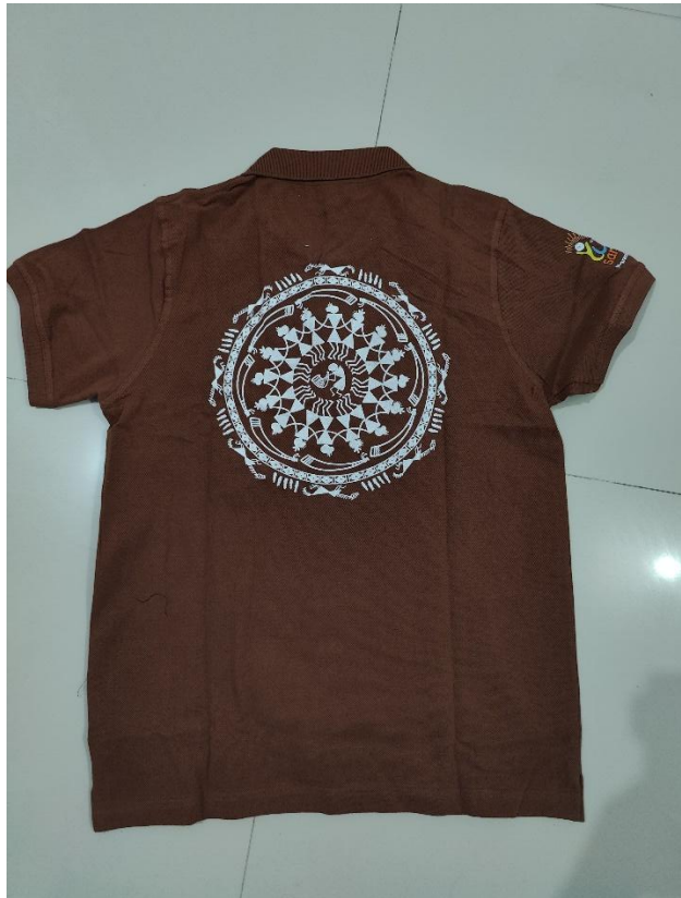
T-Shirts for delegates and all guests and coordinators