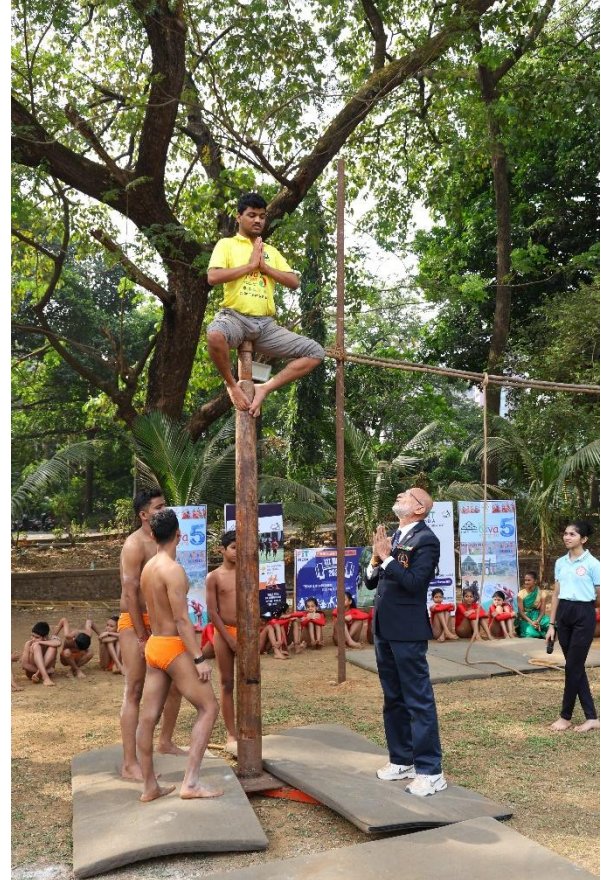
Day 3: Training the delegates with Ancient Maharashtrian Sport Mallakhamb