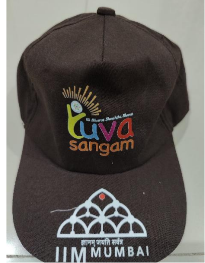
Handbag and Cap for delegates