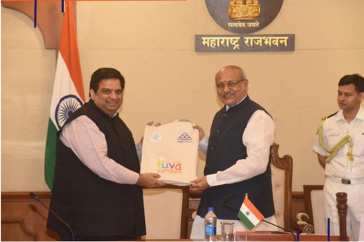
Day 2: Welcome to Hon'ble Governor of Maharashtra Shri C. P. Radhakrishnan