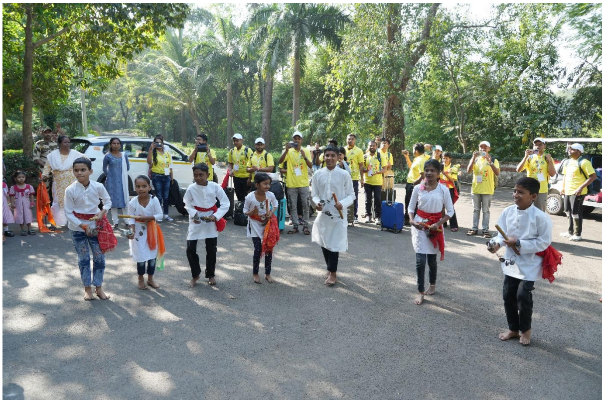
Day 1: Welcome with Lezim by Powai school student to delegates