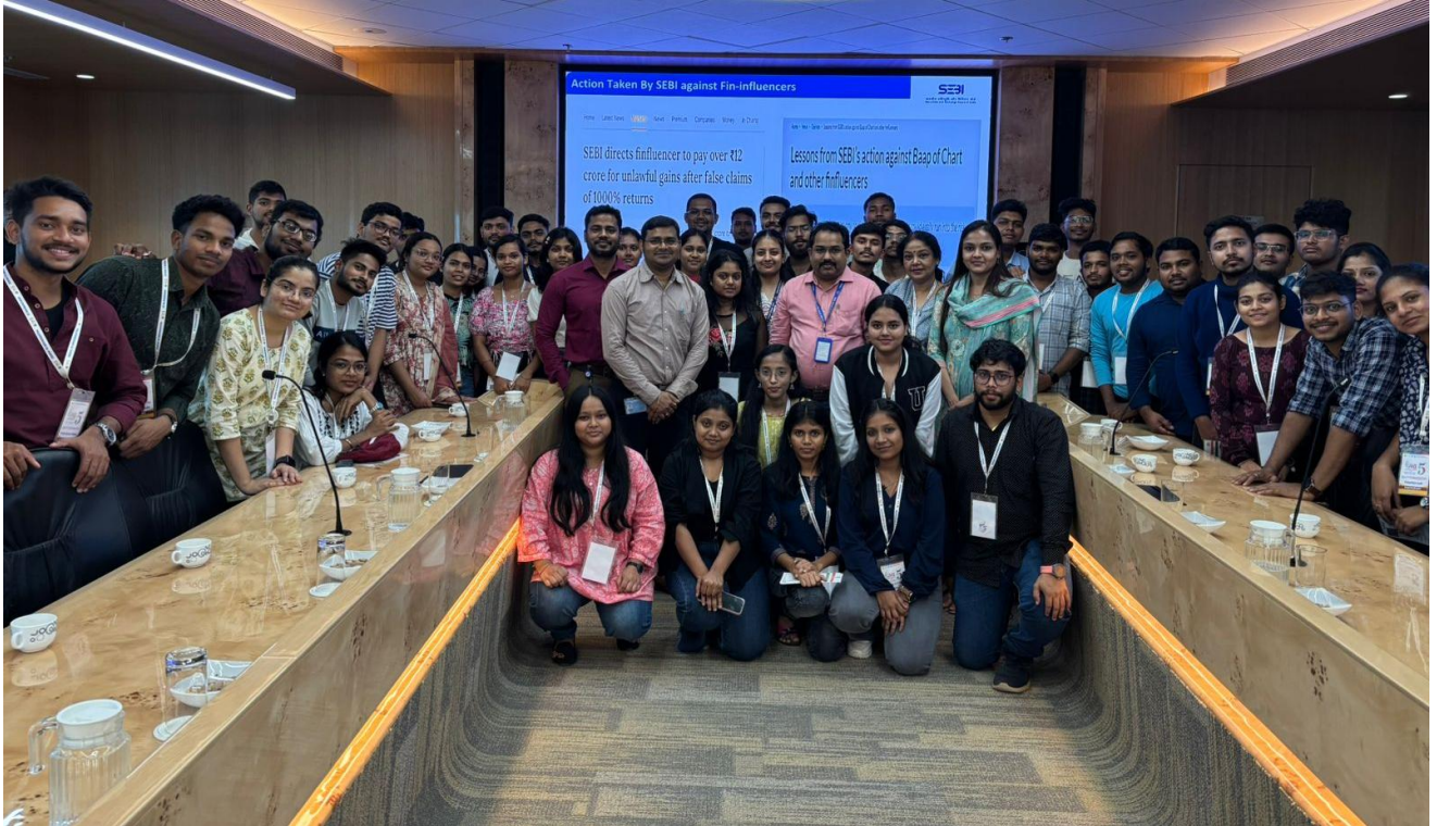
Day 5: Visit to SEBI, Mumbai