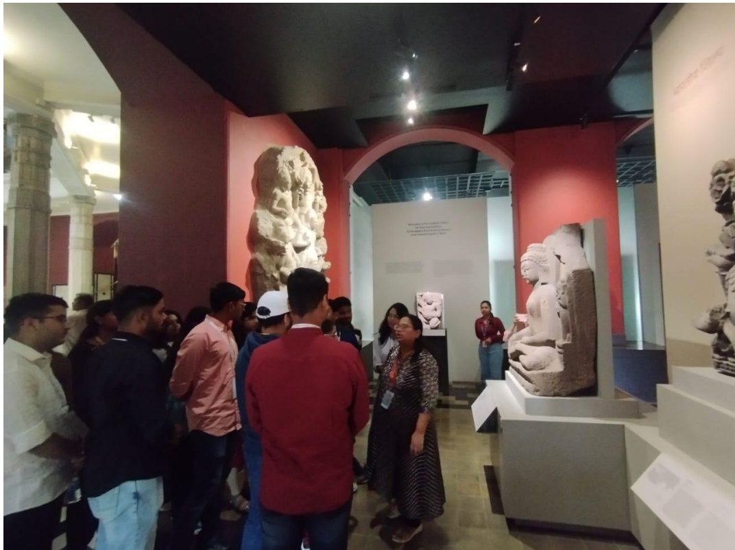
Day 2: Visit to Chhatrapati Shivaji Maharaj Vastu Sangrahalaya, formerly named the Prince of Wales Museum of Western India, Mumbai