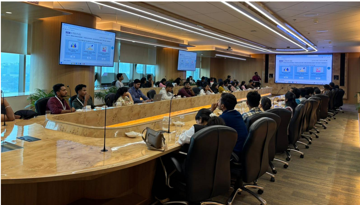
Day 5: Visit to SEBI, Mumbai.