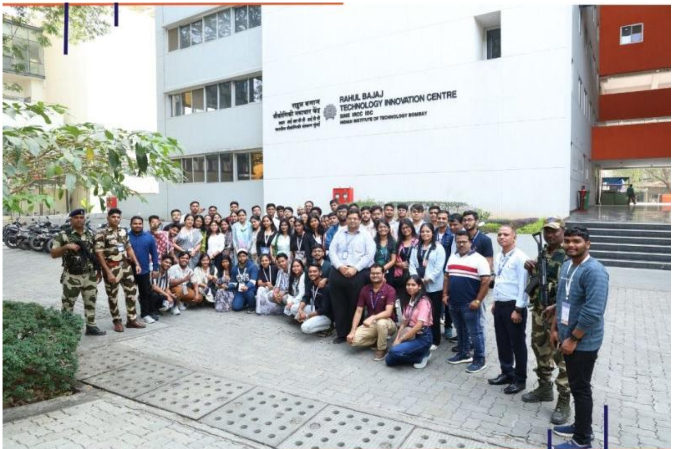
Day 4: Visit of Rahul Bajaj Technology Innovation Centre, IIT Bombay