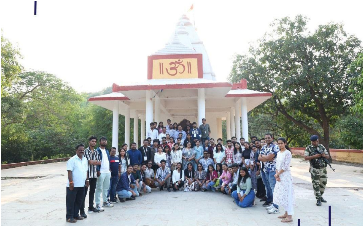
Day 4: Visit to Film City, Mumbai