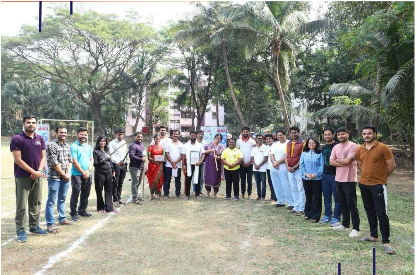
Day 3: Cultural event organized at Sports Ground, IIM Mumbai