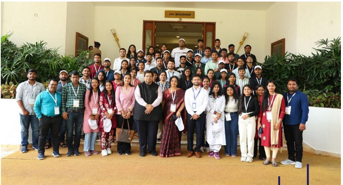
Day 2: Group photo of Raj Bhavan