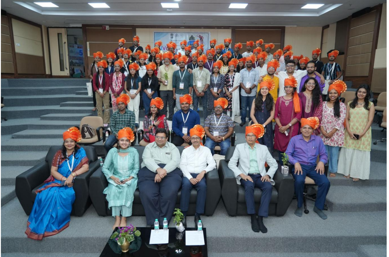
Day 1: Welcome event at LH 04, IIM Mumbai