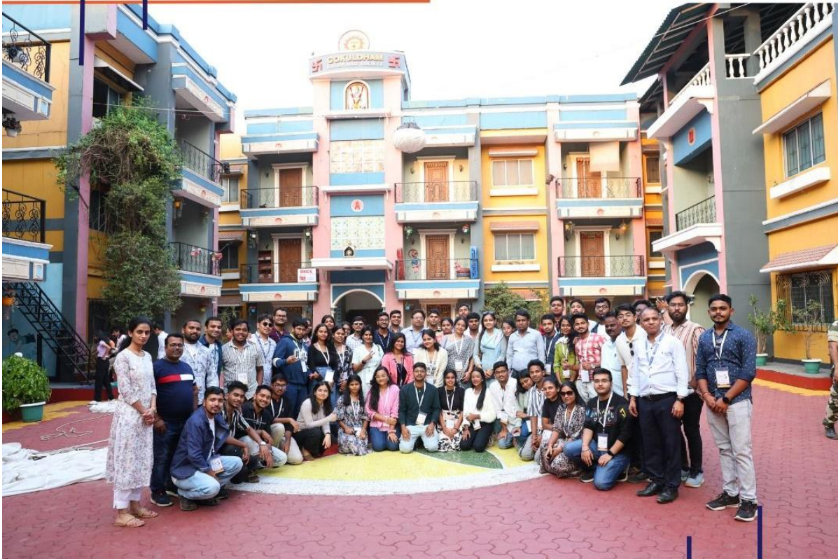
Day 4: Visit to Tarak Mehta ka ulta chashm fame Gokuldham Society, Goregaon, Mumbai