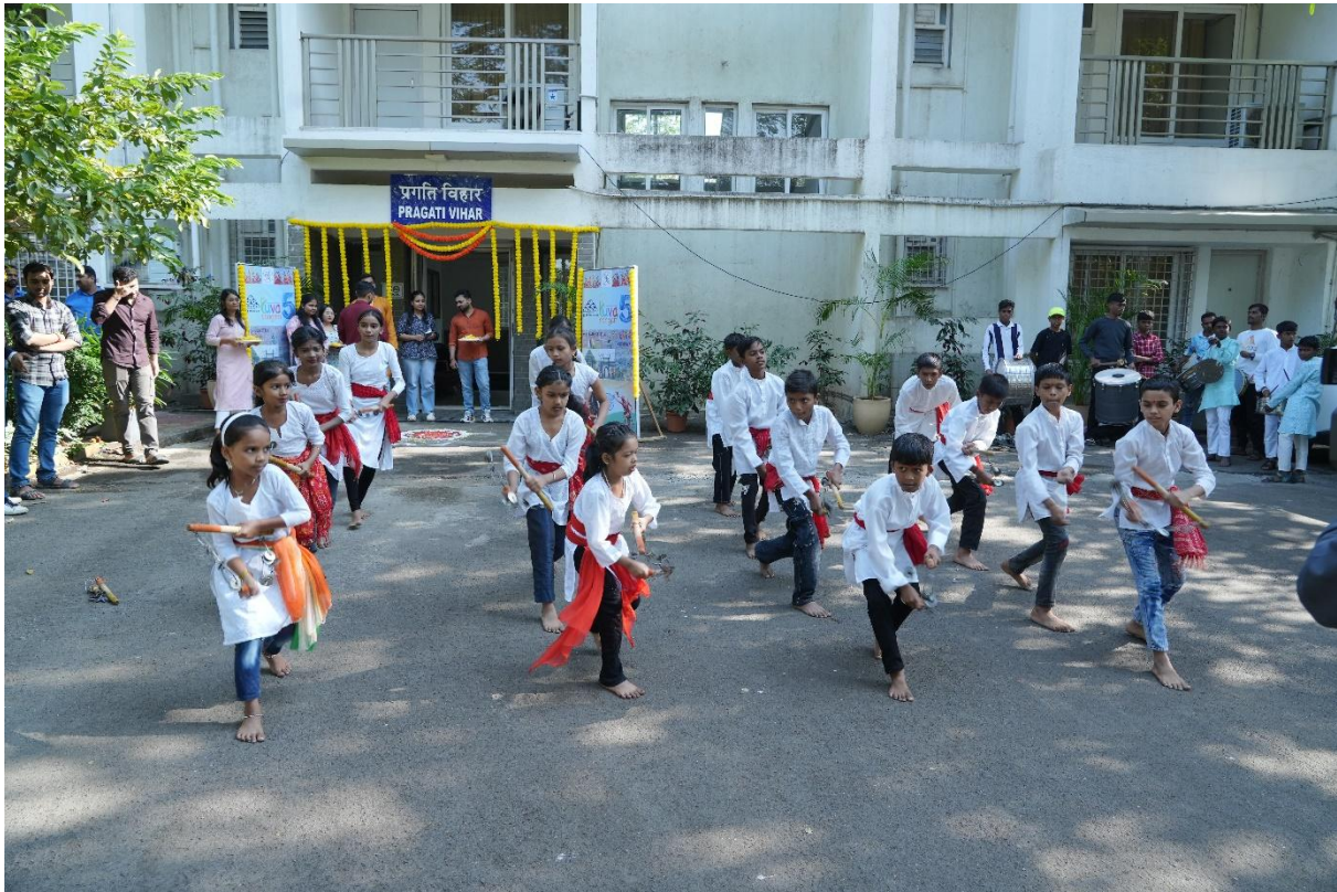
Day 1: Welcome with Lezim by Powai school student to delegates