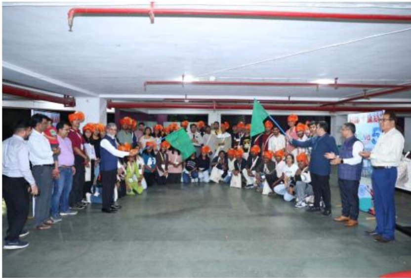
A delegation of 48 students from Maharashtra have left for IIT Bhubaneswar as a part of the fifth phase of the Government of India's cultural and educational endeavour 'Ek Bharat Shreshtha Bharat Yuva Sangam' programme.